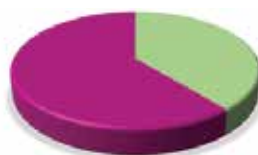
Practices Alumni - 39% New - 61%